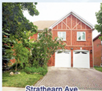
Strathearn Ave, Bayview Hill