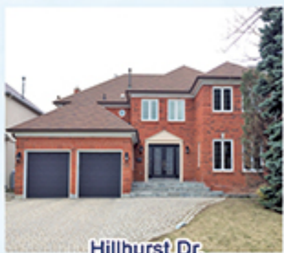
Hillhurst Dr, Bayview Hill