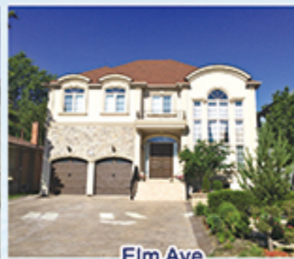
Elm Ave, Richmond Hill