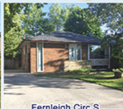
Fernleigh Circ S, Richmond Hill