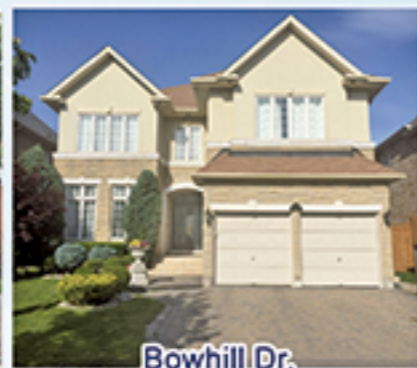
Bowhill Dr, Bayview Hill