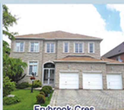
Frybrook Cres, Bayview Hill