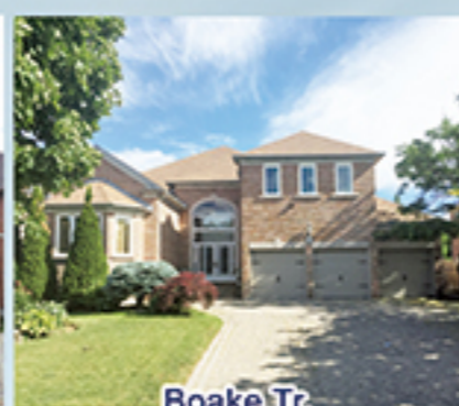
Boake Tr, Bayview Hill