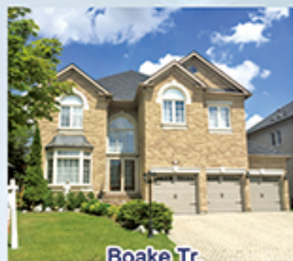
Boake Tr, Bayview Hill

Sign on VIP preview on www.BonnieWan.com