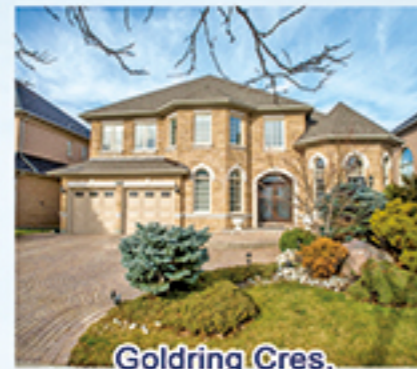
Goldring Cres, Markham