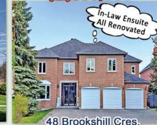
48 Brookshill Cres, Bayview Hill