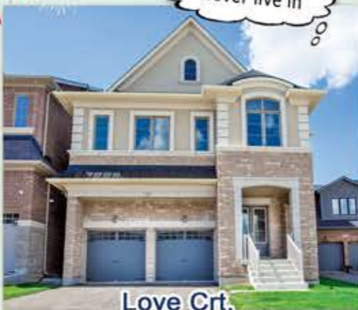
Love Crt, Bayview Hill