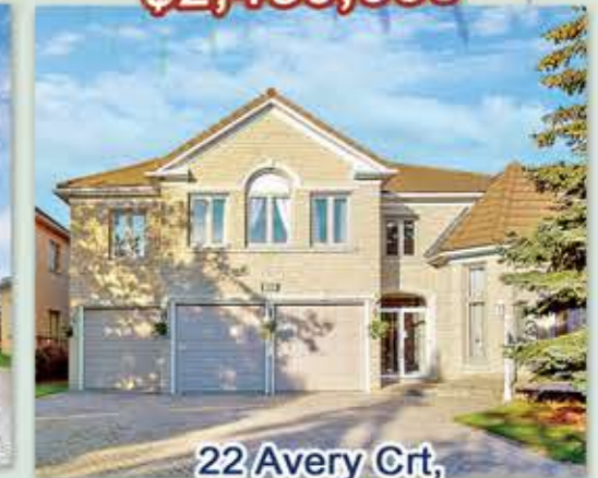
22 Avery Crt, Bayview Hill