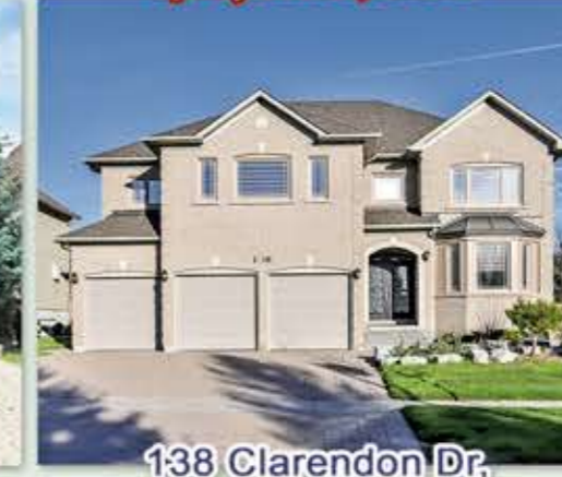
138 Clarendon Dr, Bayview Hill