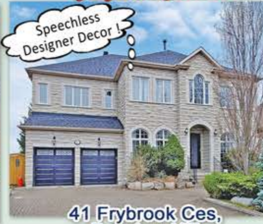
41 Frybrook Ces, Bayview Hill