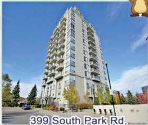
399 South Park Rd, Markham