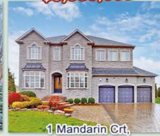
1 Mandarin Crt, Bayview Hill