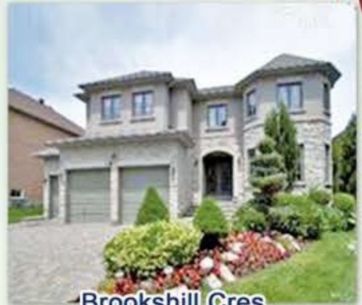
Brookshill Cres, Bayview Hill