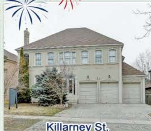
Killarney St, Bayview Hill