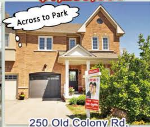
250 Old Colony Rd, Richmond Hill