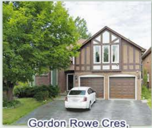
Gordon Rowe Cres, Richmond Hill