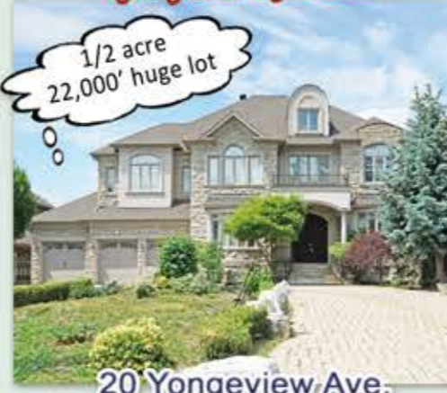
20 Yongeview Ave, Richmond Hill