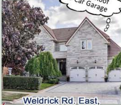
Weldrick Rd. East, Bayview Hill