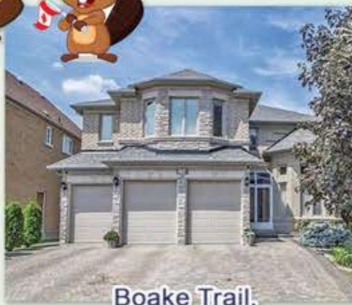
Boake Trail, Bayvie Hill