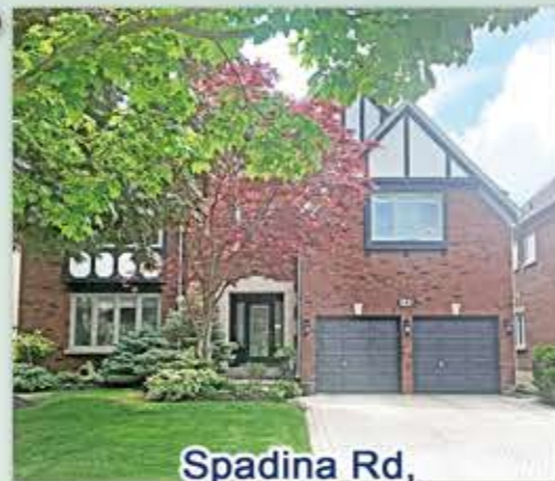
Spadina Rd, Bayview Hill