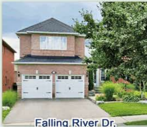
Falling River Dr, Richmond Hill