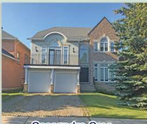
Cassandra Cres, Bayview Hill