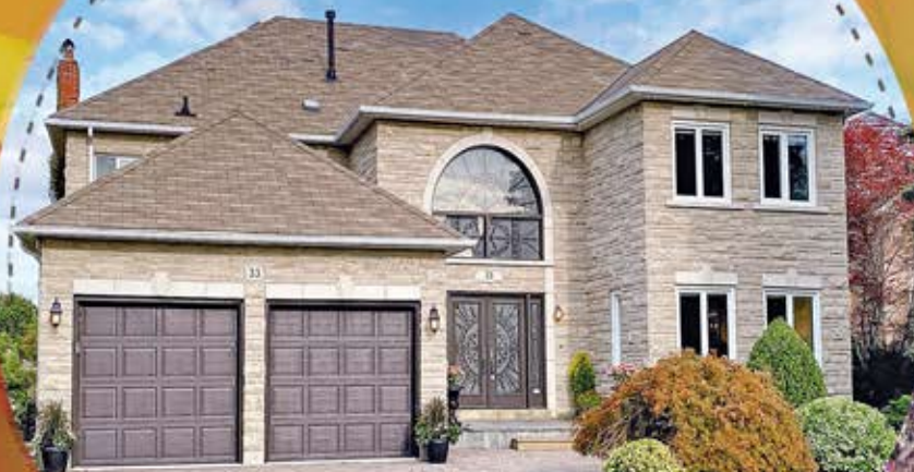
33 Glenayr Rd, Bayview Hill $ 2,950,000 *