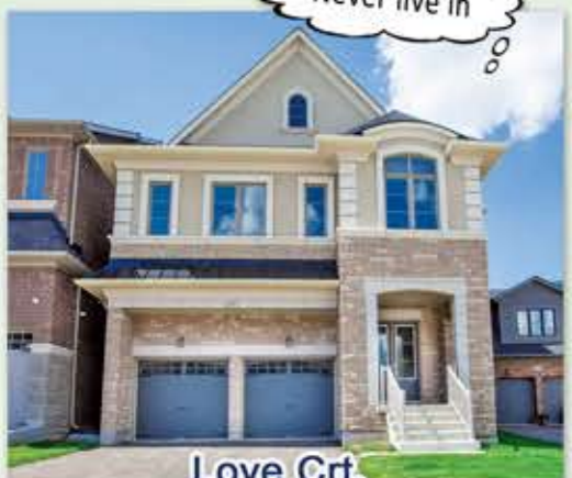
Love Ct, Bayview Hill