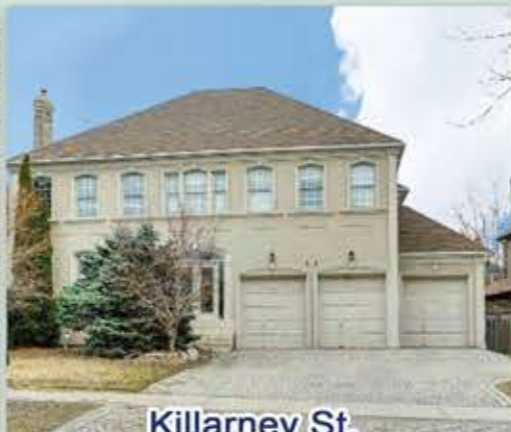
Killarney St, Bayview Hill