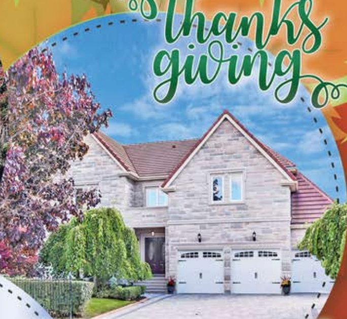
397 Weldrick Rd E, Bayview Hill $2,980,000 *