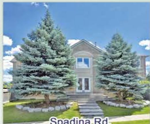
Spadina Rd, Bayview Hill