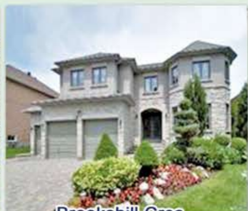
Brookshill Cres, Bayview Hill