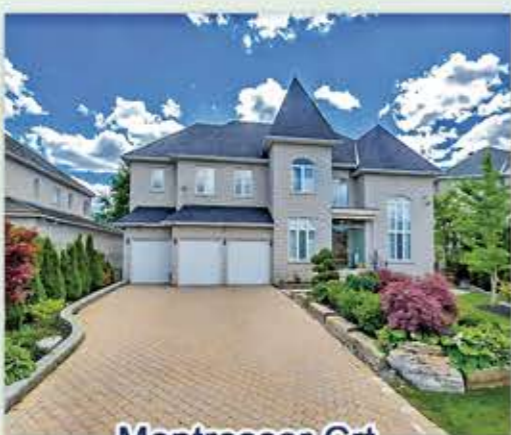
Montessoro Ct, Bayview Hill