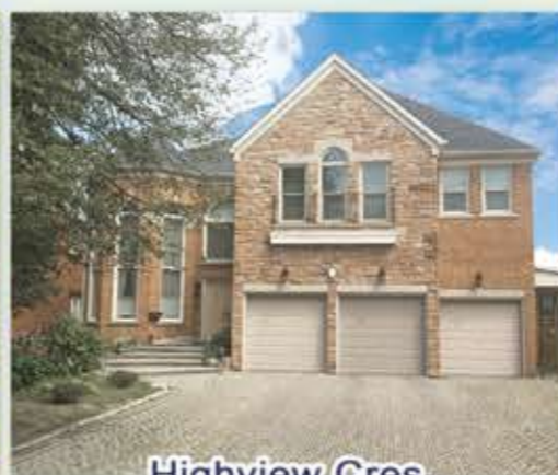
Highview Cres, Bayview Hill