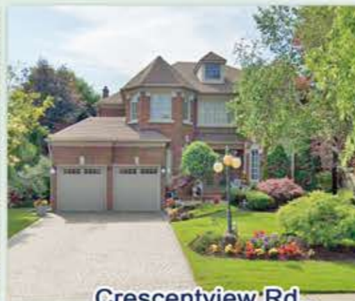
Crescentview Rd., Bayview Hill