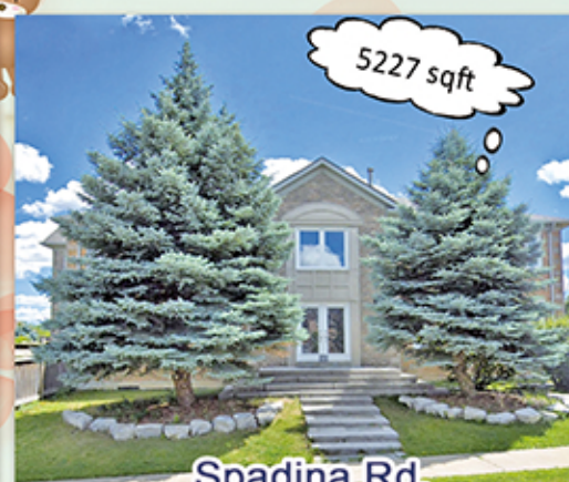
Spadina Rd, Bayview Hill