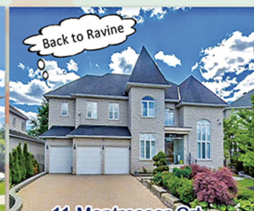
11 Montessoro Crt, Bayview Hill