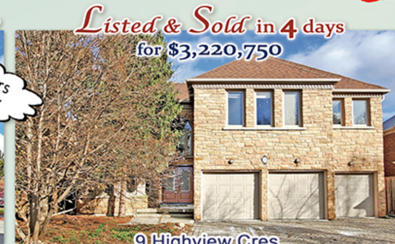
9 Highview Cres, Bayview Hill