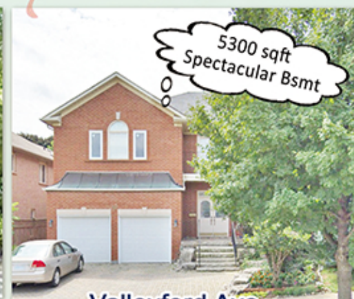
Valleyford Ave, Richmond Hill