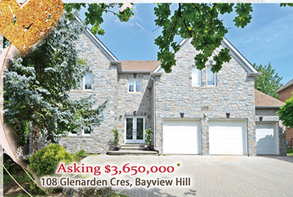
Asking $3,650,000* 108 Glenarden Cres, Bayview Hill