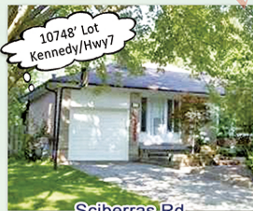
Sciberras Rd, Unionville