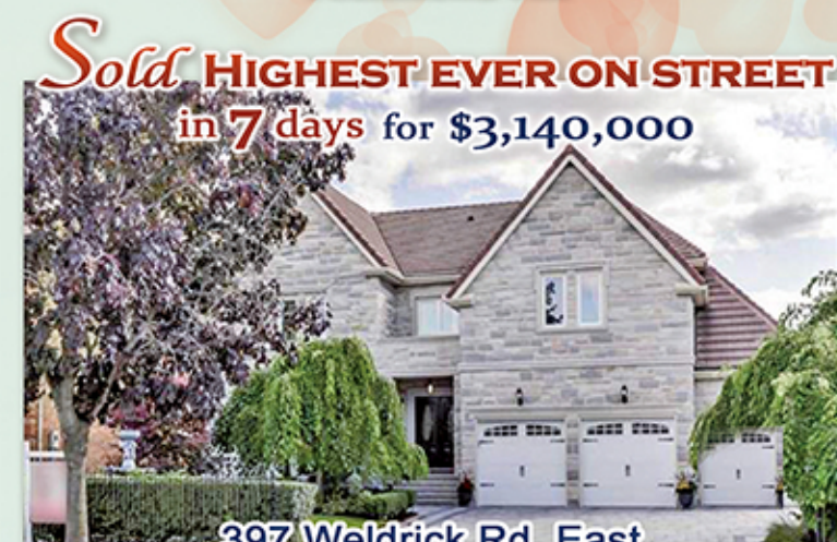
397 Weldrick Rd. East, Bayview Hill