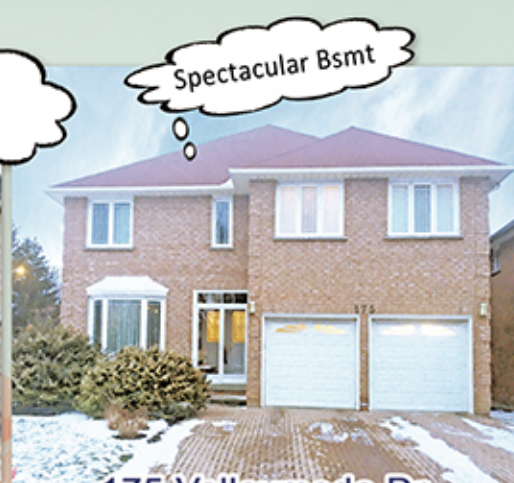
175 Valleymede Dr, Richmond Hill