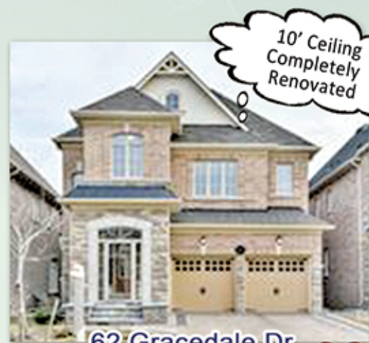
62 Gracedale Dr, Richmond Hill