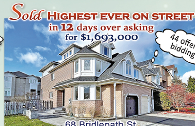
68 Bridlepath St, Richmond Hill