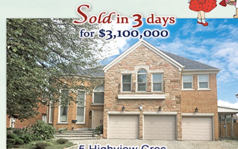
5 Highview Cres, Bayview Hill