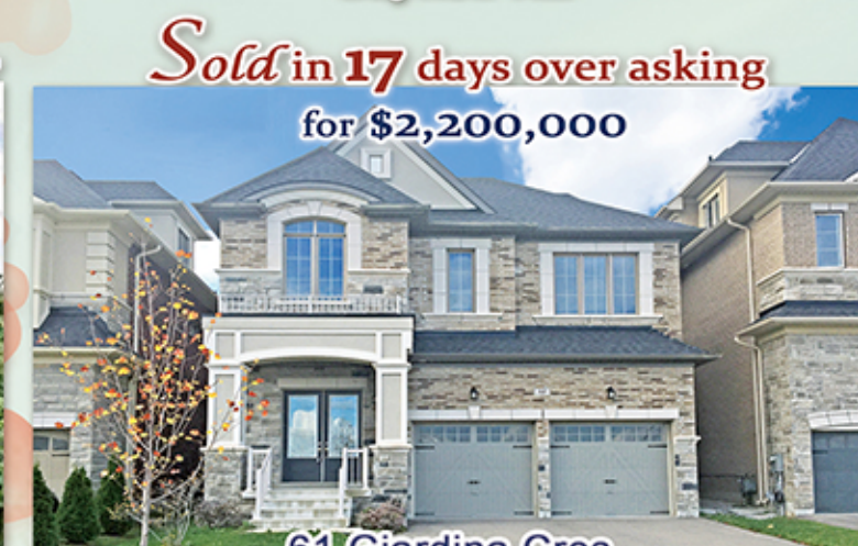
61 Giardina Cres, Bayview Hill