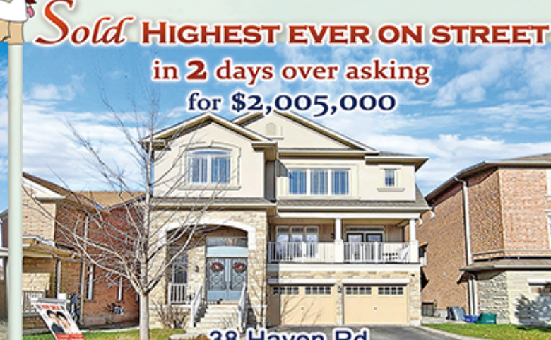
38 Haven Rd, Vaughan