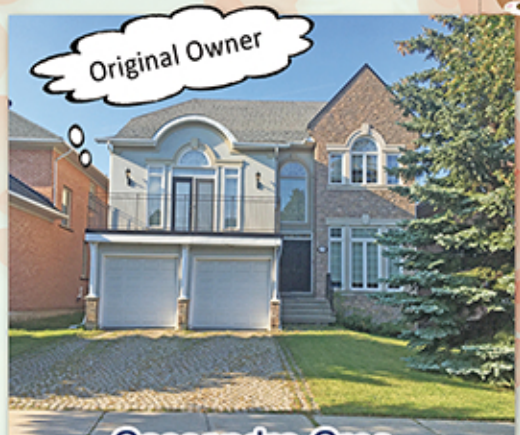
Cassandra Cres, Bayview Hill