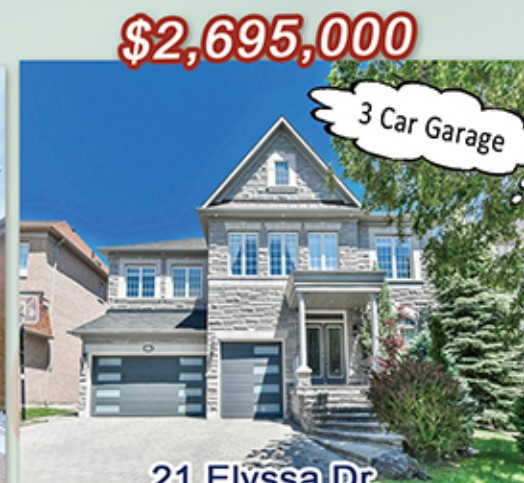
21 Elyssa Dr, Bayview Hill