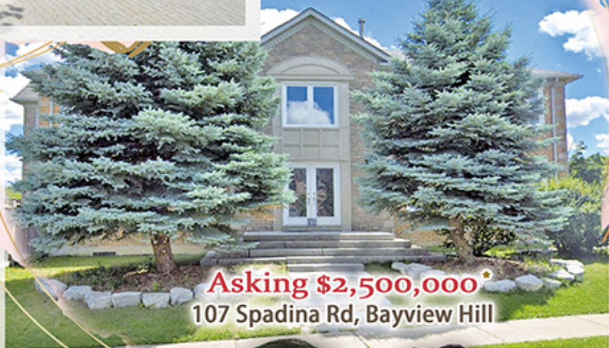
Asking $2,500,000* 107 Spadina Rd, Bayview Hill