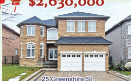
25, Greenshire St, Bayview Hill