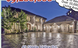
45 Steele Valley Rd, Thornhill