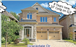
Gracedale Dr, Richmond Hill