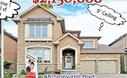
48 Stony Hill Blvd, Markham

1 Acre Lot Back to Ravine! Over 10,000 sf Living Area