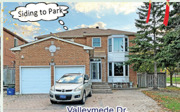
Valleymede Dr, Richmond Hill