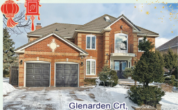
Glenarden Crt, Bayview Hill