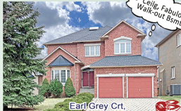
Earl Grey Crt, Bayview Hill