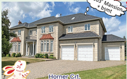
Horner Crt, Bayview Hill