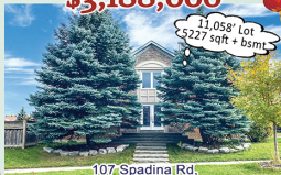
107, Spadina Rd, Bayview Hill