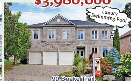
90 Boake Trail, Bayview Hill