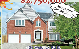
454 Weldrick Rd E, Bayview Hill