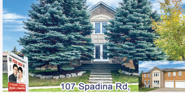
107 Spadina Rd, Bayview Hill